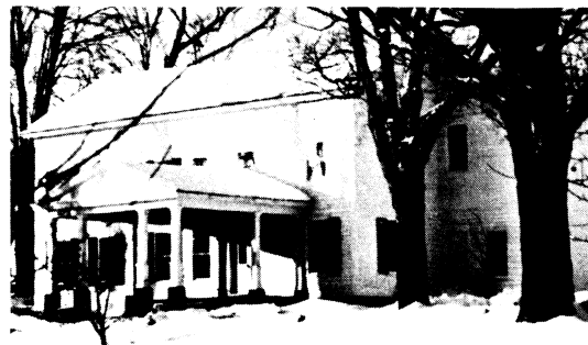
The top picture above shows the house as a tavern about 1800, and below as it looks today as a community center.

favorable, the perimeter of the Green will be lighted by candles.